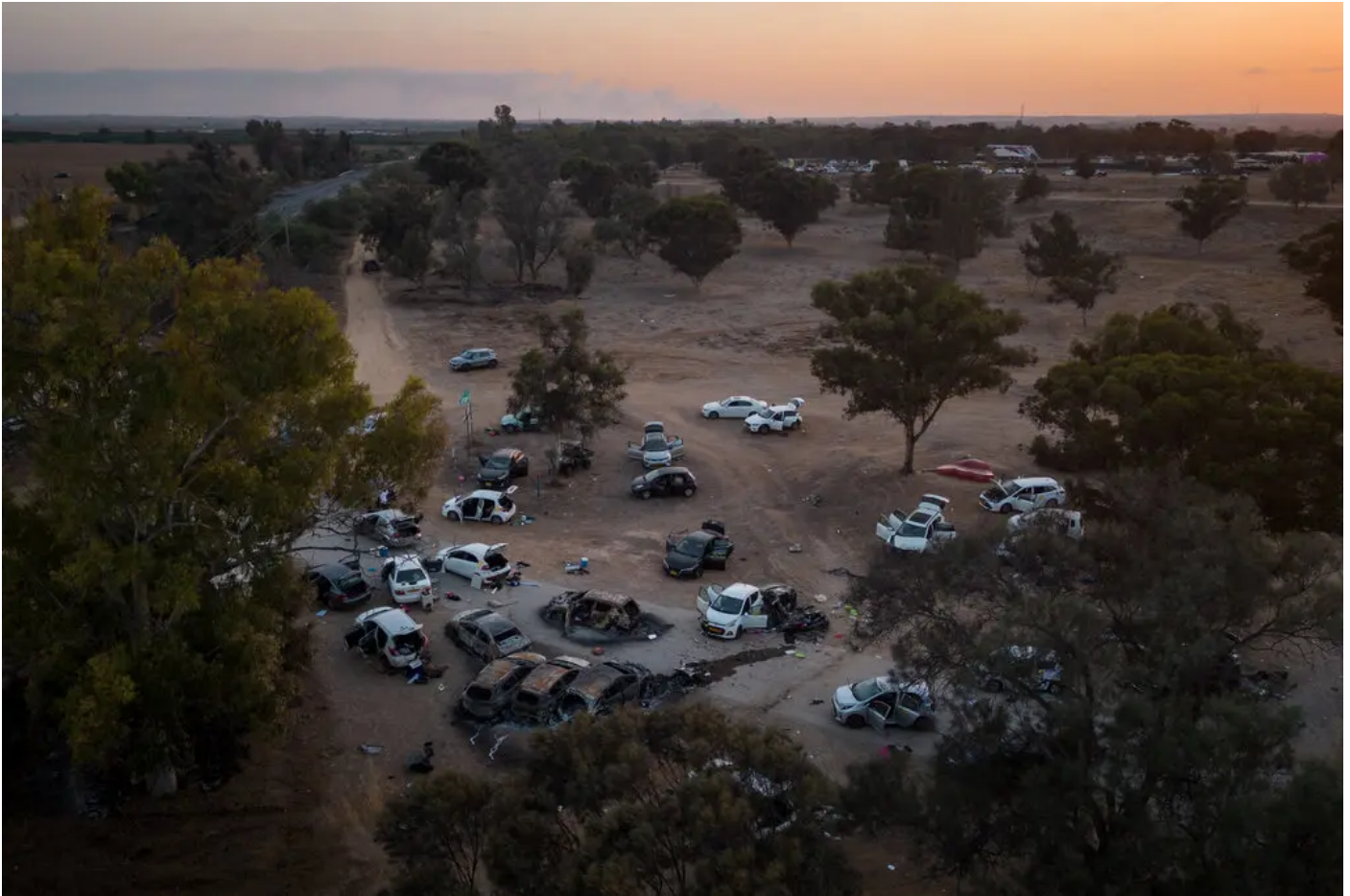
A camp area on Oct. 11 at the rave site in southern Israel.

Many of the accounts are difficult to bear, and the visual evidence is disturbing to see.