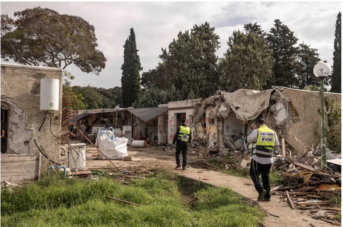
Volunteers with an emergency response team at the Kfar Aza kibbutz this month. The kibbutz was among the places attacked on Oct. 7.

She said that at 8 a.m. on Oct. 7, she was hiding under the low branches of a bushy tamarisk tree, just off Route 232, about four miles southwest of the party. She had been shot in the back. She felt faint. She covered herself in dry grass and lay as still as she could.